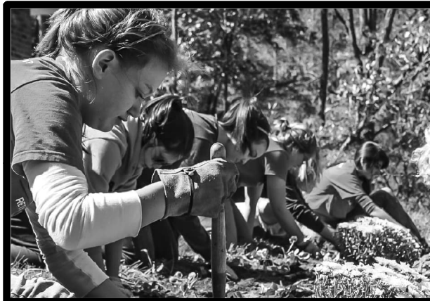
Courtesy of United Methodist Volunteers in Mission (UMVIM)—Work Project